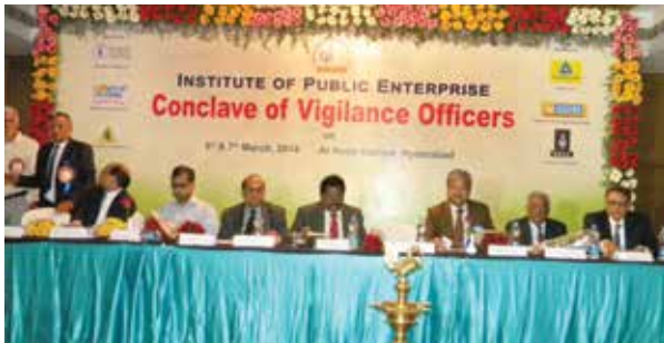
Dignitaries at the Conclave

A 'Conclave of Vigilance Officers' was held on 6 th & 7 th March 2014. The presentation ceremony of 'IPE's Vigilance Excellency Awards – 2014' to many renowned CPSEs and Banks also take place during the occasion. Companies that participated included: HAL, RINL, RCF, Neyveli Lignite, MIDHANI, ECIL, Cotton Corporation, FACT, ALMCO, SIDBI, Canara Bank, Punjab National Bank, State Bank of India – Hyd, Allahabad Bank, Mahanadi Coalfields, Northern Coalfields, and Central Coalfields. A commemorative souvenir on this occasion was brought out with received messages from the then CM (Gujarat) Sri Narendra Modi CM, Sri Akhilesh Yadav CM (UP), Smt Vasundara Raje CM (Rajasthan), HE Shekhar Dutt Governor (Chhattisgarh) HE MK Narayanan Governor (WB), and CMDs of many organisations. Participation of 5 CMDs, 25 CVOs (IAS/IPS/IRS/IFS), and many senior vigilance personnel was the highlight of this conclave. Speakers applauded IPE's initiatives in creating a unique platform for sharing of experiences in various sectors (Banking, Mining and Manufacturing).