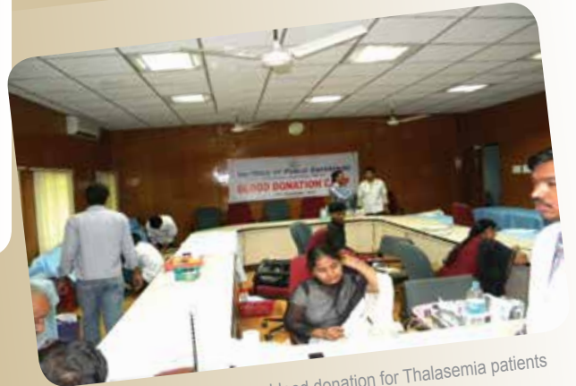
Students actively participated in blood donation for Thalassaemia patients