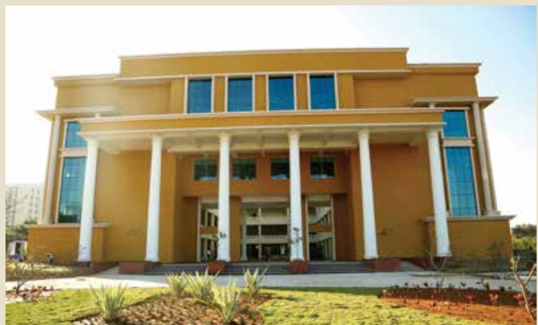
New Academic Block front view