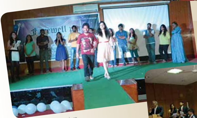
'Bidding auction' to seniors