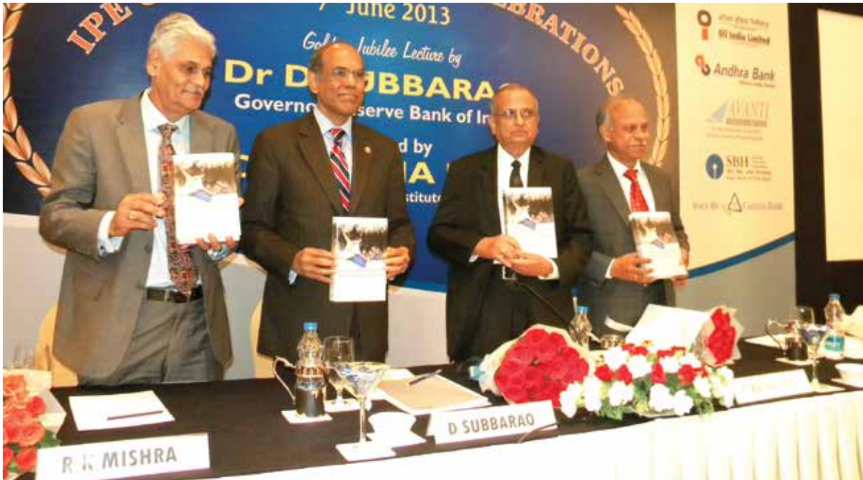
Book Launch India: Grading issues in economic development during Golden Jubilee inauguration

autonomy for these enterprises and for enabling them to face the global competition.