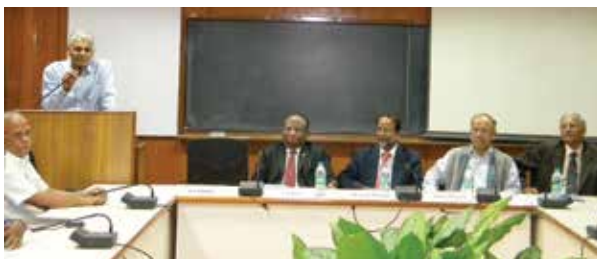
The SAQs Peer review committee at IPE

The committee carried out detailed assessment and review for the aforesaid three days and sent