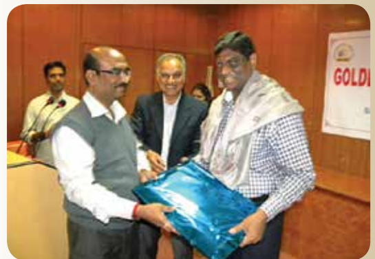
Alumni Awards Presentation