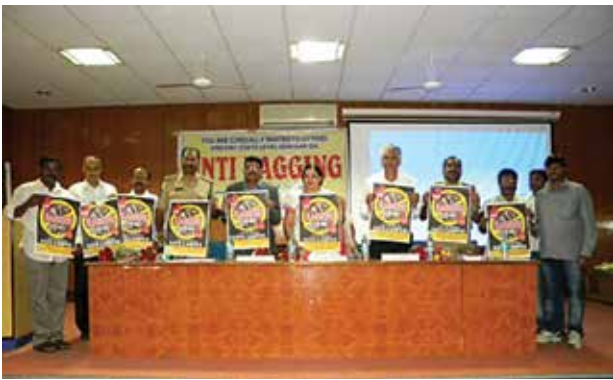
Anti-ragging campaign launched at IPE