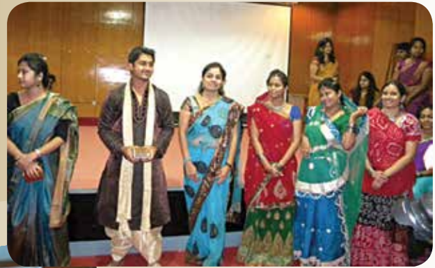
Ethnic Day at IPE