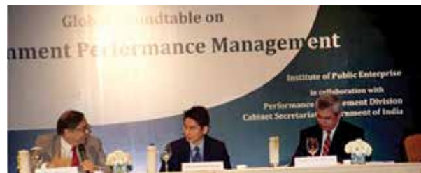
Dignitaries at the Global Round Table on Government performance management

Services, Senior Government officials, Senior Public Enterprise officials, Professional Economists, Management Consultants, Journalists, Academicians from more than 26 countries including Afghanistan, Argentina, Bangladesh, Benin, Bhutan, Brazil, Fiji, Jordan, Kenya, Malaysia, Maldives, Mauritius, Mexico, Namibia, Nigeria, Oman, Pakistan, Palestine, Peru, South Sudan, Tanzania, Turkey, Tuvalu, Zambia, Zimbabwe and India.