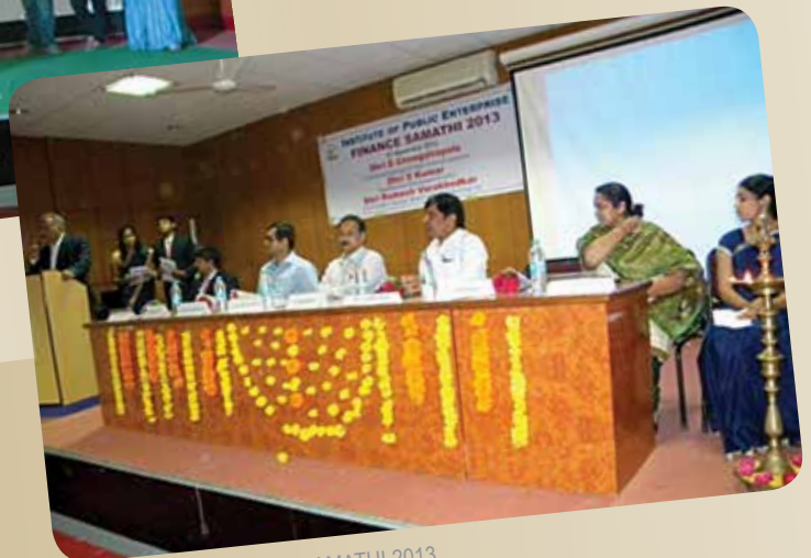
Delegates at the Finance SAMATHI 2013