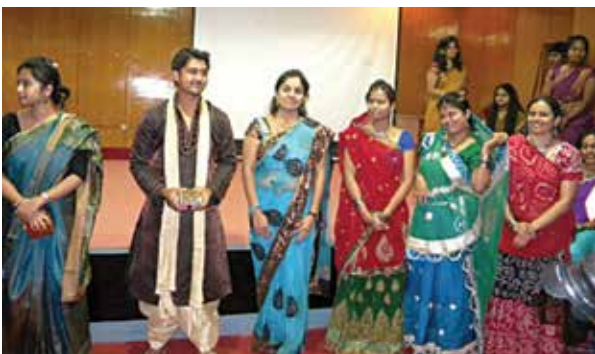
Ethnic Day at IPE

Students of the Institute of Public Enterprise organized Ethnic-Day on 1 November, at IPE, OU Campus. Students and employees arrived in traditional attires. Rangoli, Dancing and Singing competitions were conducted and prizes were distributed.