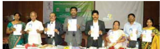
Souvenir released by dignitaries during the conference

The centre organized an International Conference on "Climate Change and Sustainable Development: Global Perspective" February 20-21, 2014.