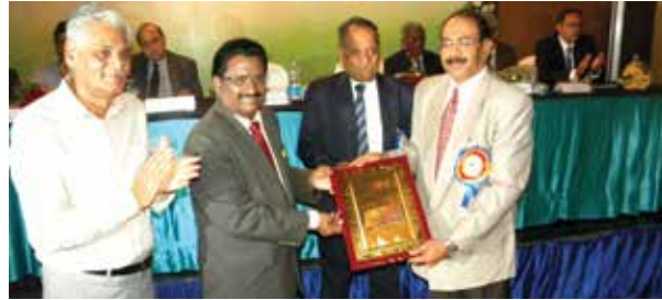
Vigilance Programme done on 6th and 7th March, 2014 at Hotel Katriya, Hyderabad.