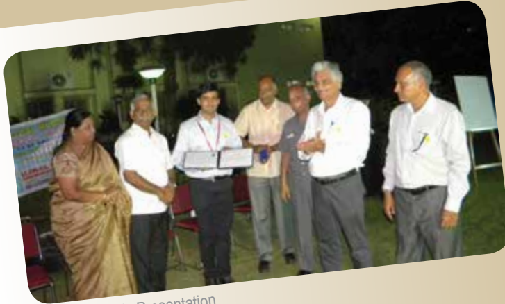
Alumni Awards Presentation