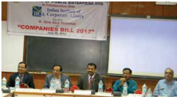
Dignitaries at the Programme on Companies Bill

The Program was attended by 26 participants from various private and public sector organizations including West Fargo, Shanta Biotech, Nava Bharat Ventures, ONGC, BHEL, HUDCO, BDL etc.