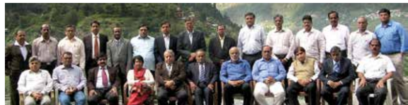
Board Orientation program at Manali