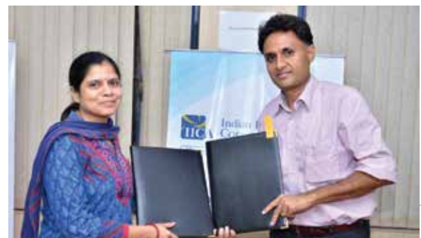
Representatives of IPE and IICA during MoU signing ceremony

Institute of Public Enterprise has signed an MoU with Indian Institute of Corporate Affairs on