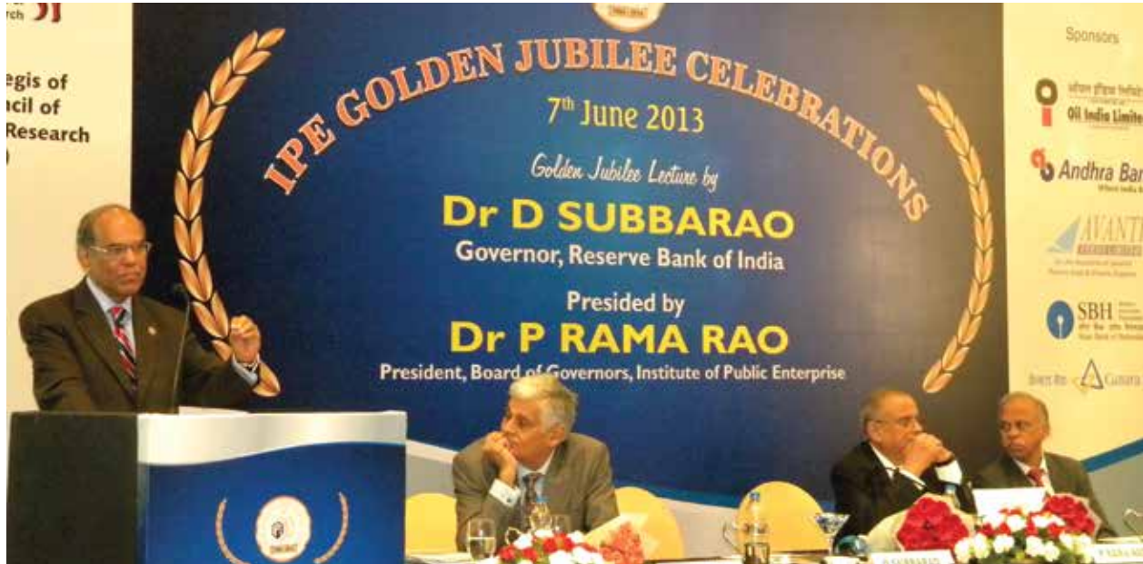
Dr D Subba Rao, Governor RBI delivering the Golden Jubilee distinguished Lecture