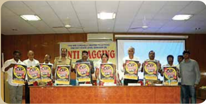
Anti-ragging campaign launched at IPE