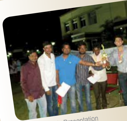
Alumni Awards Presentation