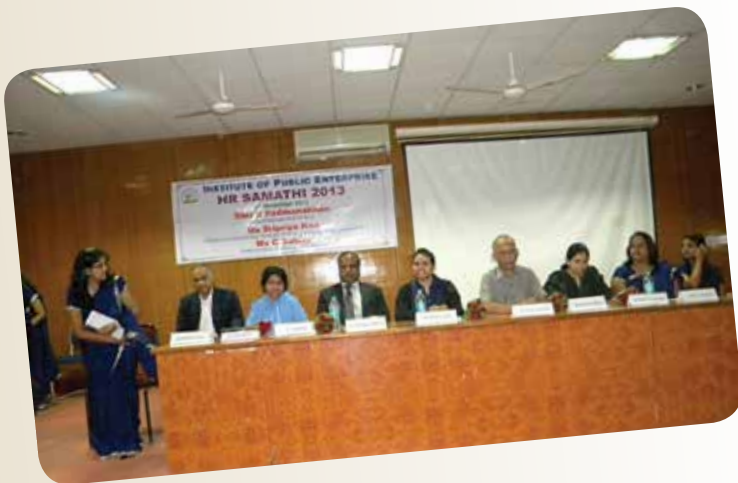
HR SAMATHI inaugurated