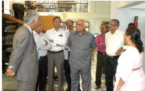
The Evaluation Team from AIU