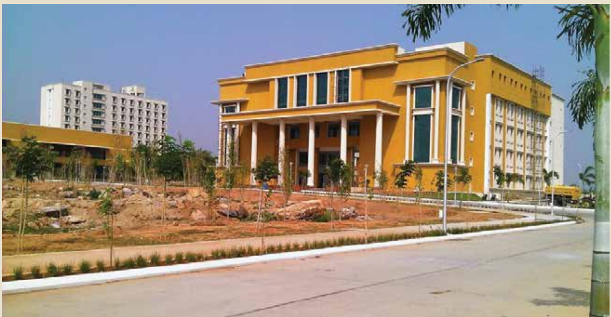
New Academic Block

To further enhance the scope of its activities, the Institute is expanding its infrastructure facilities by building a new residential campus at Shameerpet village, on the outskirts of Hyderabad. The sprawling 17-acre campus is located in a peaceful locality, surrounded by a reserve forest on one side and the beautiful Shameerpet lake on the other. With a total built-up area of 5.50 lakh sft, the campus will house a state-of-the-art academic block, an administration block, a modern library, an MDP block, a food court, an auditorium and several sports facilities. It will also have comfortable facilities to accommodate 600 boys and 400 girls.